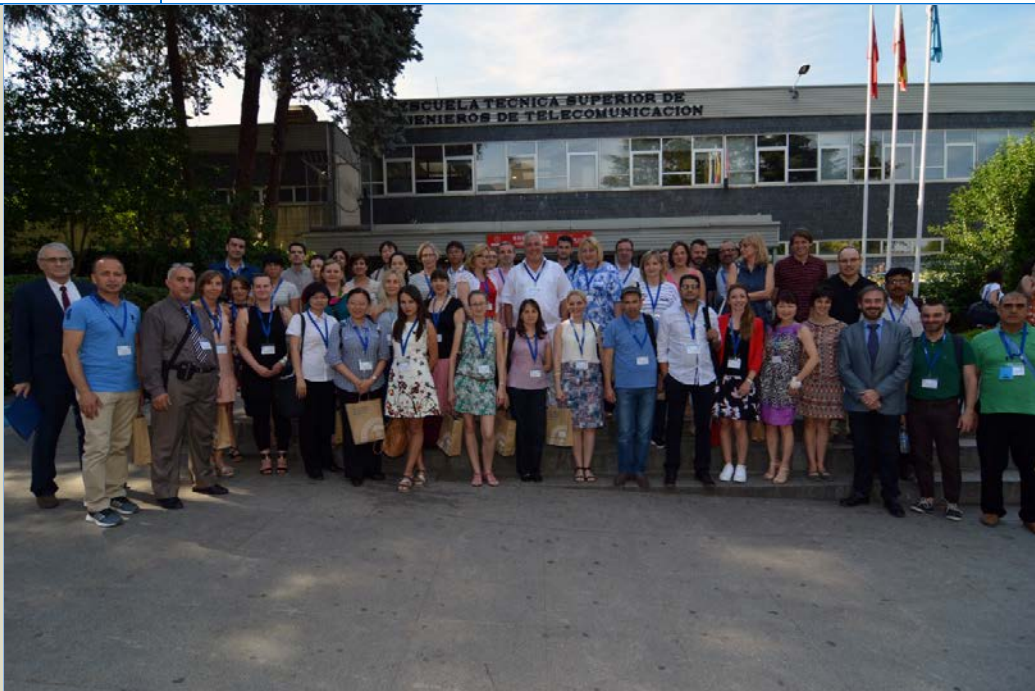
Family photo of the 14th International Week - UPM 2017